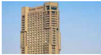
Ramses Hilton | ★★★★★

Ramses Hilton is situated in the Heart of Cairo near the Egyptian Museum. The hotel offers 3 restaurants along with 2 coffee shops/café, a poolside bar, and a lounge bar. The 771 air-conditioned guestrooms include laptop-compatible safes and minibars.