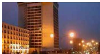
Regency Palace Amman Hotel | ★★★★★

Daniel Dead Sea Hotel is a luxurious 5 star property conveniently located only 6.2 mi from the centre of Dead Sea. The hotel boasts 302 fully equipped bedrooms. Enjoy a meal at one of the hotel's 3 dining establishments plus a café. From your room, you can also access 24-hour room service.