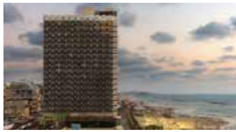
Herods Tel Aviv | ★★★★★

Ramses Hilton is situated in the Heart of Cairo near the Egyptian Museum. The hotel offers 3 restaurants along with 2 coffee shops/café, a poolside bar, and a lounge bar. The 771 air-conditioned guestrooms include laptop-compatible safes and minibars.