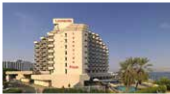
Leonardo Plaza Hotel Tiberias | ★★★★★

St. Catherine Village, Wadi El Raha is located in South Sinai and offers spacious chalets with a terrace. It boasts a restaurant with a 24-hour room service. The property features beautiful views of St. Catherine Monastery. All accommodation at St. Catherine Village, Wadi El Raha are air-conditioned and simply furnished.