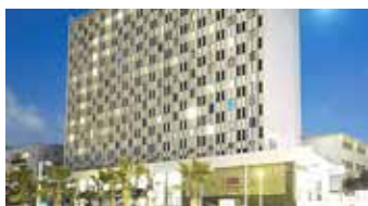
Grand Beach Tel Aviv Hotel | ★★★★★

This hotel is only 5 minutes from the Great Pyramids of Giza and a short distance from the center of Cairo providing contemporary rooms and accommodations. The rooms are fully air-conditioned and feature modern art prints. The stylish bathrooms include a shower and modern amenities.