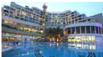
Enjoy Dead Sea Hotel | ★★★★★

The hotel is within 1.2 m. from Petra. Guests can enjoy a continental breakfast with 5-star accommodation, plus an indoor pool. 24-hour assistance is available at the reception. All rooms have Wi-Fi access, tea and coffee making facilities, television, air conditioning, safe deposit box and a mini bar. The bathrooms are well equipped with bath/shower, hair dryer and complimentary toiletries.