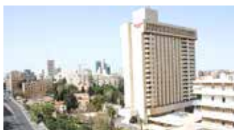
Leonardo Plaza Hotel Jerusalem | ★★★★★

The indoor rooftop pool of Regency Palace offers a panoramic view of Amman. The hotel is ideally located near the city center. Guests can enjoy the rich buffets at Al Madafa restaurant with Jordanian Cuisine, and Polynesian cuisine at Trader Vic's Restaurant, and at the bar you will find Cuban music and fine wines.