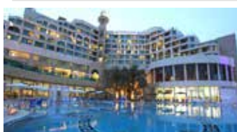
Enjoy Dead Sea Hotel | ★★★★★

A 4-minute walk from the Petra Visitor Center, this upscale, family-run hotel flanked by Mountains is 6 km from the iconic Ad Deir monument carved from red sandstone. Warm rooms with a polished vibe offer flat-screen TVs, free Wi-Fi and minibars, as well as tea and coffeemaking facilities. Upgraded rooms offer mountain views. Airy family rooms add sitting areas. Room service is available.