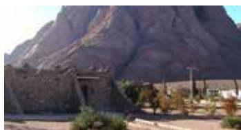
Wadi El Raha | ★★★★★

Located in a prime location in the heart of Tel Aviv, the Grand Beach Hotel offers 212 spacious rooms with a stylish urban design. Enjoy the warm beaches of Tel Aviv, only a few minutes away from the exciting Carmel Market, prestige restaurants and cafes, leading clubs and bars, shopping and cultural centers.