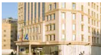
Barceló Cairo Pyramids | ★★★★★

This hotel is only 5 minutes from the Great Pyramids of Giza and a short distance from the center of Cairo providing contemporary rooms and accommodations. The rooms are fully air-conditioned and feature modern art prints. The stylish bathrooms include a shower and modern amenities.