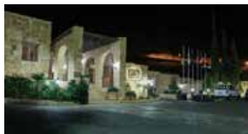
The Old Village Hotel & Resort | ★★★★★

The Leonardo Plaza Hotel Tiberias offers an amazing location in the heart of Tiberias, facing the promenade and overlooking the famous Sea of Galilee and nearby to the Tiberias shopping center. The hotel provides 258 comfortable rooms with balcony.