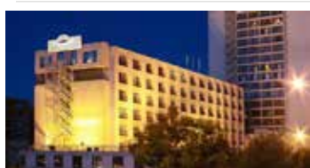
Grand Palace Amman | ★★★★★

Daniel Dead Sea Hotel is a luxurious 5 star property conveniently located only 6.2 mi from the centre of Dead Sea. The hotel boasts 302 fully equipped bedrooms. Enjoy a meal at one of the hotel's 3 dining establishments plus a café. From your room, you can also access 24-hour room service.