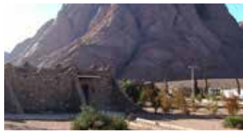
Wadi El Raha | ★★★★★

A 10-minute walk from Tel Aviv Marina, this upscale hotel overlooking a sandy beach is 2 km from both the Tel Aviv Performing Arts Center and the Culture Palace, home to the Israel Philharmonic Orchestra. Relaxed rooms feature flat-screen TVs, free Wi-Fi and safes, plus minibars, and tea and coffeemaking facilities; many have balconies with sea views.