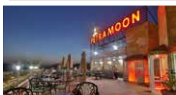
Petra Moon Hotel | ★★★★★

The Leonardo Club Hotel Tiberias is the perfect starting point to discover the attractive city of Tiberias, the Golan Heights, or to enjoy a stroll along the beautiful beaches. The hotel provides 398 elegant rooms with private balcony and outstanding facilities.