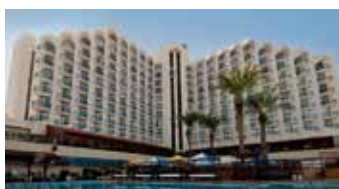
Leonardo Club Hotel Tiberias | ★★★★★

St. Catherine Village, Wadi El Raha is located in South Sinai and offers spacious chalets with a terrace. It boasts a restaurant with a 24-hour room service. The property features beautiful views of St. Catherine Monastery. All accommodation at St. Catherine Village, Wadi El Raha are air-conditioned and simply furnished.