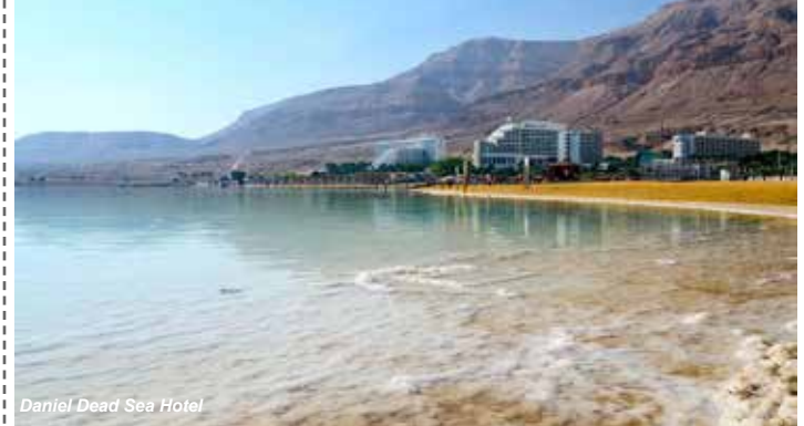
Daniel Dead Sea Hotel

Daniel Dead Sea Hotel is a luxurious 5 star property conveniently located only 6.2 mi from the centre of Dead Sea. The hotel boasts 302 fully equipped bedrooms. Enjoy a meal at one of the hotel's 3 dining establishments plus a café. From your room, you can also access 24-hour room service.