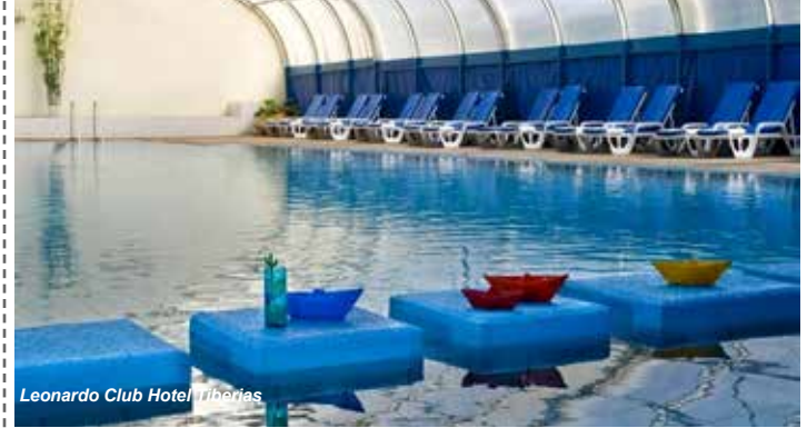
Leonardo Club Hotel Tiberias

Daniel Dead Sea Hotel is a luxurious 5 star property conveniently located only 6.2 mi from the centre of Dead Sea. The hotel boasts 302 fully equipped bedrooms. Enjoy a meal at one of the hotel's 3 dining establishments plus a café. From your room, you can also access 24-hour room service.