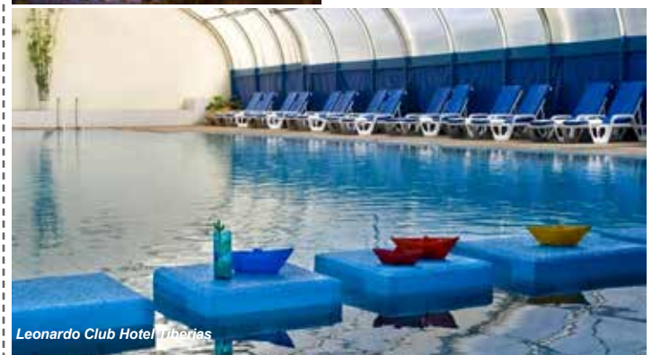
Leonardo Club Hotel Tiberias

Daniel Dead Sea Hotel is a luxurious 5 star property conveniently located only 6.2 mi from the centre of Dead Sea. The hotel boasts 302 fully equipped bedrooms. Enjoy a meal at one of the hotel's 3 dining establishments plus a café. From your room, you can also access 24-hour room service.