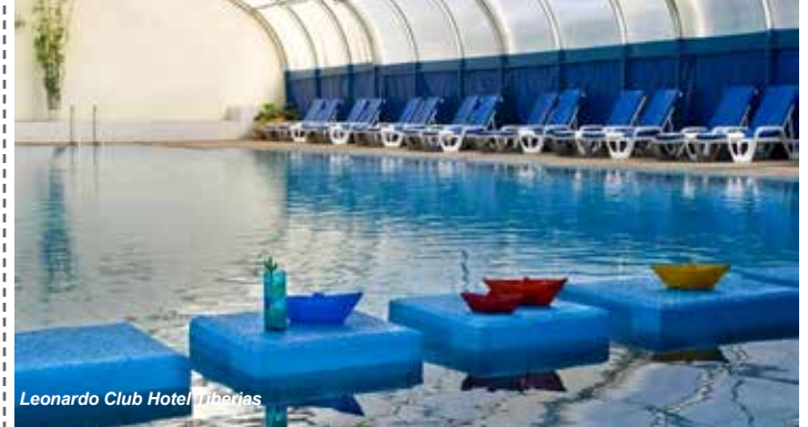
Leonardo Club Hotel Tiberias

Enjoy Dead Sea Hotel is a peaceful retreat on the Dead Sea's shores, offering stunning views, comfortable rooms, excellent dining, and a luxurious spa with mineral-rich treatments. Guests can float in the therapeutic waters, explore nearby attractions like Masada and Ein Gedi, or simply relax in the tranquil surroundings. Whether seeking adventure or relaxation, this hotel provides the perfect setting.