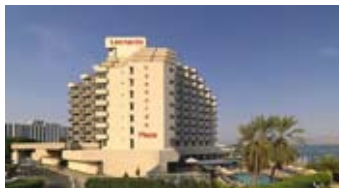
Leonardo Plaza Hotel Tiberias | ★★★★★

St. Catherine Village, Wadi El Raha is located in South Sinai and offers spacious chalets with a terrace. It boasts a restaurant with a 24-hour room service. The property features beautiful views of St. Catherine Monastery. All accommodation at St. Catherine Village, Wadi El Raha are air-conditioned and simply furnished.