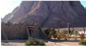
Wadi El Raha | ★★★★★

A stylish beachfront hotel offering luxurious accommodations along the Mediterranean coast. With contemporary design, exceptional service, and stunning sea views, Herods Tel Aviv provides an ideal setting for both relaxation and exploring the vibrant city.