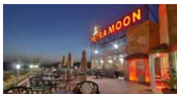
Petra Moon Hotel | ★★★★★

The Leonardo Club Hotel Tiberias is the perfect starting point to discover the attractive city of Tiberias, the Golan Heights, or to enjoy a stroll along the beautiful beaches. The hotel provides 398 elegant rooms with private balcony and outstanding facilities.