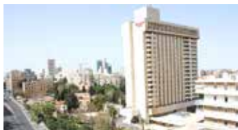
Leonardo Plaza Hotel Jerusalem | ★★★★★

A luxurious 5-star hotel in the heart of Amman, offering elegant accommodations and world-class service. Featuring modern amenities, fine dining, and stunning city views, the Regency Palace is the perfect base for exploring Jordan's rich history and culture.