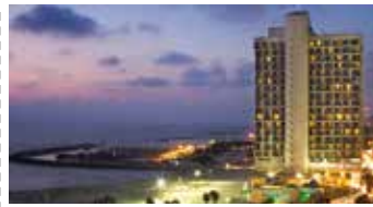
Renaissance Tel Aviv Hotel | ★★★★★

Ramses Hilton is situated in the Heart of Cairo near the Egyptian Museum. The hotel offers 3 restaurants along with 2 coffee shops/café, a poolside bar, and a lounge bar. The 771 air-conditioned guestrooms include laptop-compatible safes and minibars.