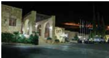
The Old Village Hotel & Resort | ★★★★★

Located on the shores of the Sea of Galilee, this elegant hotel offers spacious rooms with breathtaking views. Featuring modern amenities, a relaxing spa, and excellent dining options, Leonardo Plaza Hotel Tiberias is the perfect retreat for both leisure and spiritual travelers.