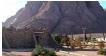
Wadi El Raha | ★★★★★

The Renaissance Tel Aviv Hotels offers 338 rooms and has a privileged location directly on the beach of the Mediterranean Sea and within easy access to dining, shopping, and entertainment. The extraordinary service & attention to detail will make your holy land trip a wonderful experience.