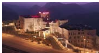
Petra Marriott Hotel | ★★★★★

The Leonardo Plaza Hotel Tiberias offers an amazing location in the heart of Tiberias, facing the promenade and overlooking the famous Sea of Galilee and nearby to the Tiberias shopping center. The hotel provides 258 comfortable rooms with balcony.