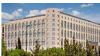
Grand Court Hotel Jerusalem | ★★★★★

The Grand Palace Amman is centrally located in the modern progressive district of Shumessani. The hotel offers 138 guest rooms fitted with air-conditioning, minibar, safe-box and wireless internet access with large bathrooms. The rooms are fitted with sound proof windows.