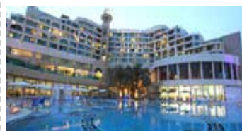
Daniel Dead Sea Hotel | ★★★★★

A 4-minute walk from the Petra Visitor Center, this upscale, family-run hotel flanked by Mountains is 6 km from the iconic Ad Deir monument carved from red sandstone. Warm rooms with a polished vibe offer flat-screen TVs, free Wi-Fi and minibridges, as well as tea and coffee-making facilities. Upgraded rooms offer mountain views. Airy family rooms add sitting areas. Room service is available.