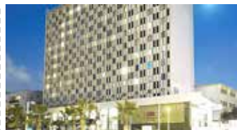
Grand Beach Tel Aviv Hotel | ★★★★★

This hotel is only 5 minutes from the Great Pyramids of Giza and a short distance from the center of Cairo providing contemporary rooms and accommodations. The rooms are fully air-conditioned and feature modern art prints. The stylish bathrooms include a shower and modern amenities.