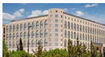
Grand Court Hotel Jerusalem | ★★★★★

The Grand Palace Amman is centrally located in the modern progressive district of Shumesani. The hotel offers 138 guest rooms fitted with air-conditioning, minibar, safe-box and wireless internet access with large bathrooms. The rooms are fitted with sound proof windows.